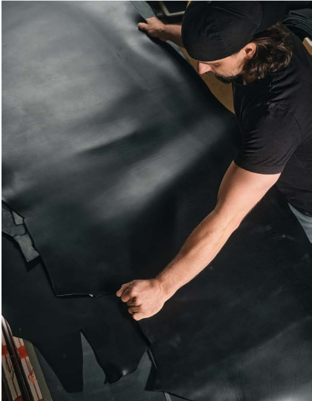
natural leather attributes